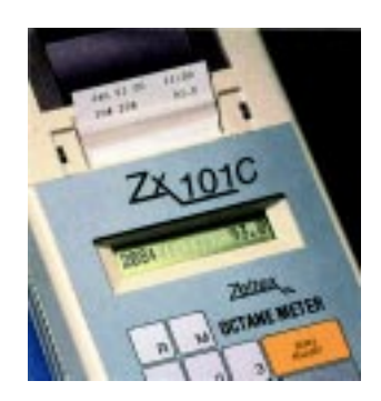
Octane Number is displayed and printed in 20 seconds